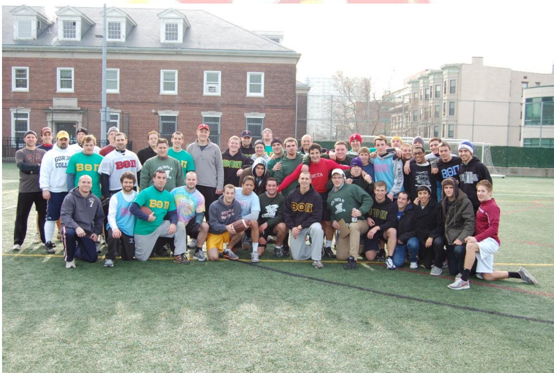
(Above) Picture of The Sigma Chapters Alumni and Actives before they face off in the epic seasonal foot ball game