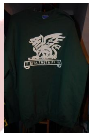
(Above) Beta Theta Pi Pledge Sweatshirt