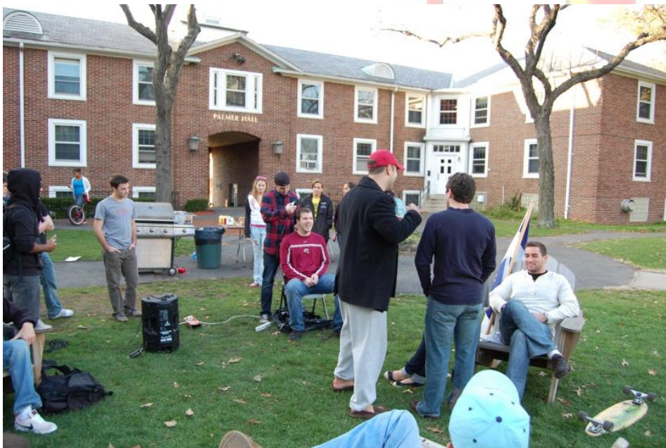
(Left) Brothers prepare for the haircut they promised after raising money for the Curesearch foundation.