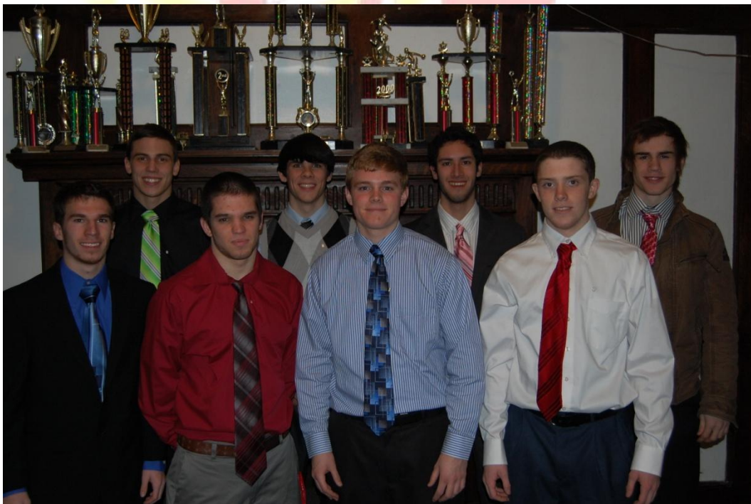
(Above) The Sigma Chapter welcomes the pledge class of 2011!